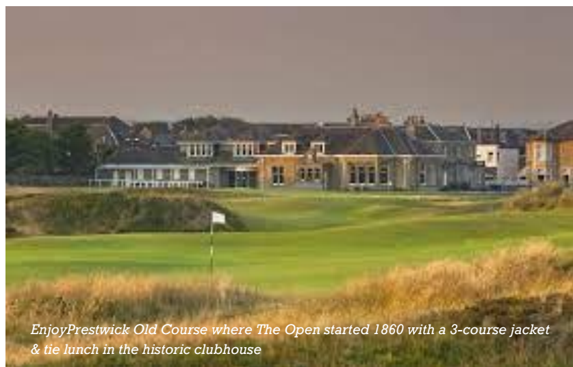
Enjoy Prestwick Old Course where The Open started 1860 with a 3-course jacket & tie lunch in the historic clubhouse