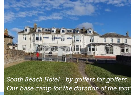
South Beach Hotel - by golfers for golfers. Our base camp for the duration of the tour.