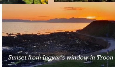
Sunset from Ingvar's window in Troon