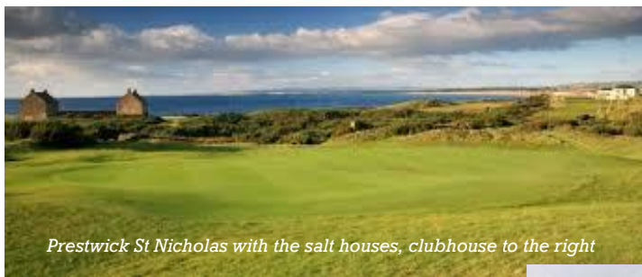
Prestwick St Nicholas with the salt houses, clubhouse to the right