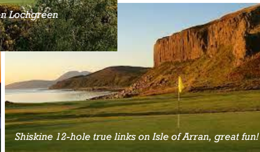
Shiskine 12-hole true links on Isle of Arran, great fun!