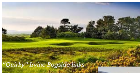
"Quirky" Irvine Bogside links