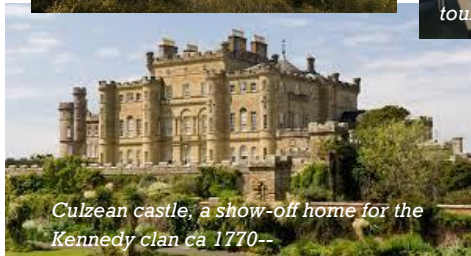
Culzean castle, a show-off home for the Kennedy clan ca 1770--