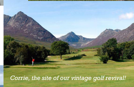
Corrie, the site of our vintage golf revival!